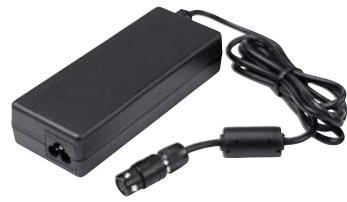
Power Cord 708-0042-00