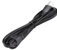
Power Supply and Power Cord 710-0731-01