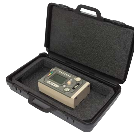
Ventilator Hard Case with Wheels 703-0731-02